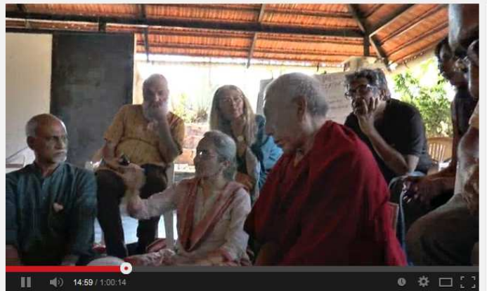
Economics of Happiness - Swaraj, Economic Democracy, Localisation

perspectives social movements economic democracy happiness swaraj well-being people's movements structural change structural transformation paradigm transformation globalisation NGOs